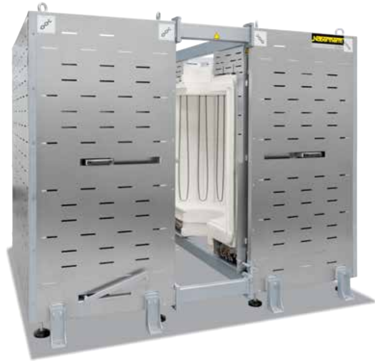
RS 460/1000/16S for integration in a production plant