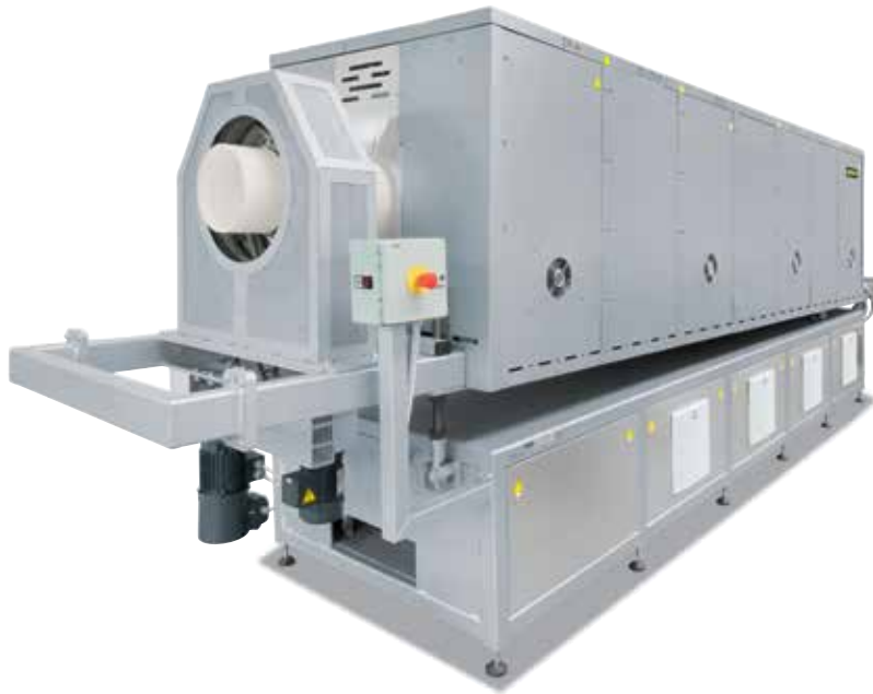
Rotary Tube Furnace RSR 250/3500/15S