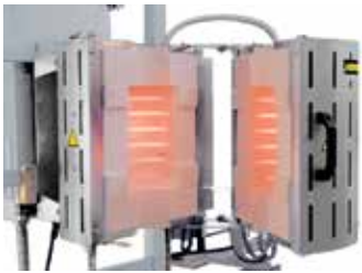
RS 100/250/11S in split-type design for integration into a test stand

With their high level of flexibility and innovation, Nabertherm offers the optimal solution for customer-specific applications.