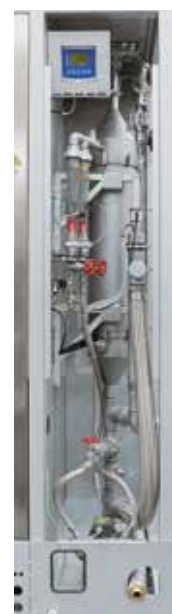
Scrubber to clean generated process gases by washing out

A scrubber will be often used if the generated gases cannot be effectively treated with a thermal afterburner system or with a torch. To clean, detox or decontaminate the exhaust gas stream a liquid is used to wash or neutralize unwanted pollutants. The scrubber can be adapted to the process by designing its liquid distribution and contact area and by selecting the most suitable washing liquid. Liquids may simply be water or special reagents or even suspensions to successfully remove unwanted gases, liquids or particles from the exhaust gas.