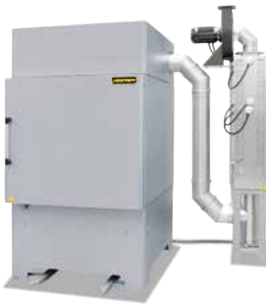
Air circulation chamber furnace NA 500/65 DB200 with catalytic afterburner system.