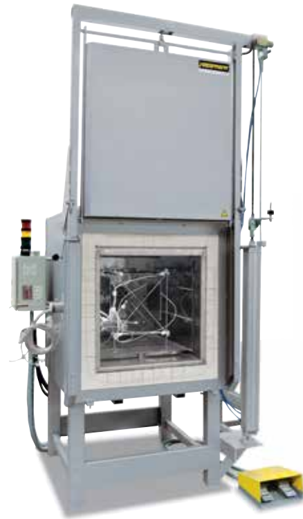
Holding frame for measurement of temperature uniformity

In standard furnaces a temperature uniformity is guaranteed as +/- K without measurement of temperature uniformity. However, as additional feature, a temperature uniformity measurement at a reference temperature in the work space compliant with DIN 17052-1 can be ordered. Depending on the furnace model, a holding frame which is equivalent in size to the work space is inserted into the furnace. This frame holds thermocouples at 11 defined measurement positions. The measurement of the temperature uniformity is performed at a reference temperature specified by the customer at a pre-defined dwell time. If necessary, different reference temperatures or a defined reference working temperature range can also be calibrated.