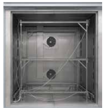
Pluggable frame for measurement for air circulation chamber furnace N 7920/45 HAS