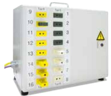
TUS module with ports for 16 thermocouples and PROFIBUS connection to the Nabertherm Control Center

The TUS module has its own PLC which converts the measurement results of the testing thermocouples. The evaluation, including an easy-to-navigate and simply log function, is then performed via the furnace's Nabertherm Control Center.