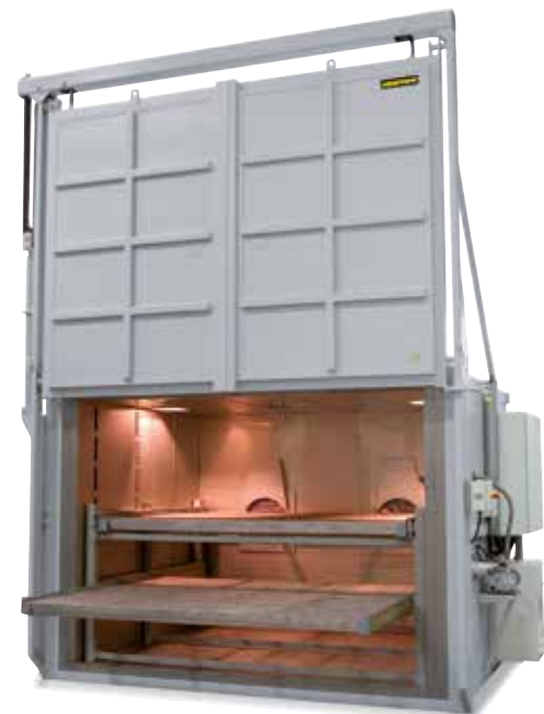
N 12012/26 HAS1 according to AMS 2750 E

As an alternative to instrumentation with the Nabertherm Control Center (NCC) and PLC controls, instrumentation with controllers and temperature recorders is also available. The temperature recorder has a log function that must be configured manually. The data can be saved to a USB stick and be evaluated, formatted, and printed on a separate PC. Besides the temperature recorder, which is integrated into the standard instrumentation, a separate recorder for the TUS measurements is needed (see page 64).