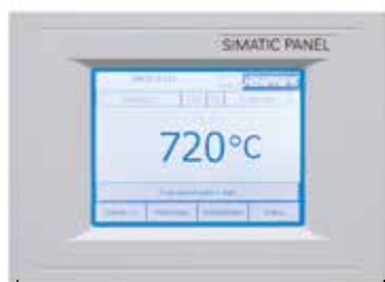
Precision of the controls, e.g. +/- 2 °C