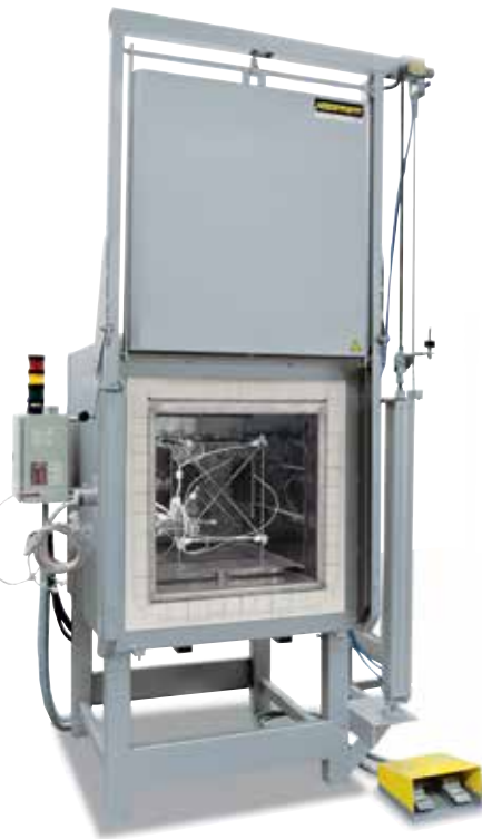
Holding frame for measurement of temperature uniformity

For the configuration of furnace and control system to meet specific industry standards such as AMS 2750 E, CQI-9, or FDA, Naberm offers adapted solutions. See our catalog „Thermal Process Technology“