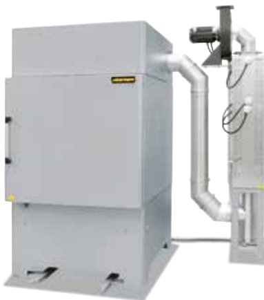
Forced convection chamber furnace NA 500/65 DB200 with catalytic post combustion