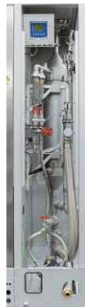
Exhaust gas washer to clean generated process gases by washing out

An exhaust gas washer will be often used if the generated gases cannot be effectively treated with a thermal post combustion or with a torch. To clean, detox or decontaminate the exhaust gas stream a liquid is used to wash or neutralize unwanted pollutants. The exhaust gas washer can be adapted to the process by designing its liquid distribution and contact area and by selecting the most suitable washing liquid. Liquids may simply be water or special reagents or even suspensions to successfully remove unwanted gases, liquids or particles from the exhaust gas.