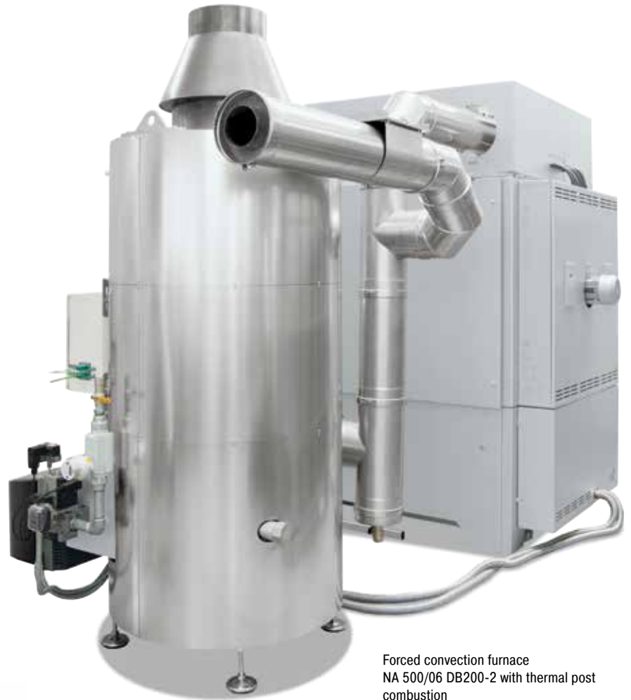
Forced convection furnace NA 500/06 DB200-2 with thermal post combustion