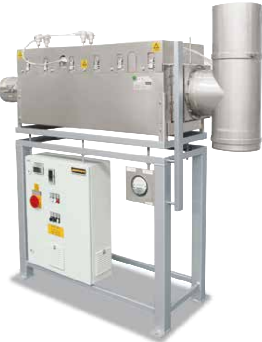
Catalytic post combustion independent from furnace model for refitting on existing plants

For exhaust gas cleaning, in particular in debinding, Nabertherm offers exhaust gas cleaning systems tailored to the process. The post combustion is permanently connected to the exhaust gas fitting of the furnace and accordingly integral part of the control system and the safety matrix of the furnace. For existing furnaces, independent exhaust gas cleaning systems are also available that can be separately controlled and operated.