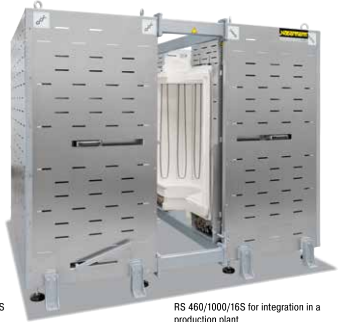
RS 460/1000/16S for integration in a production plant

With their high level of flexibility and innovation, Nabertherm offers the optimal solution for customer-specific applications.