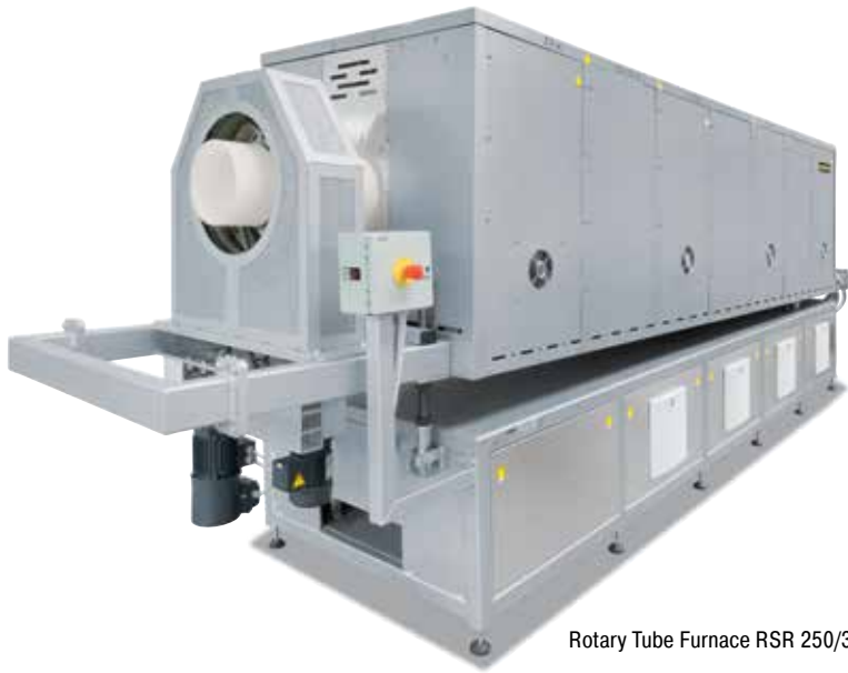
Rotary Tube Furnace RSR 250/3500/15S