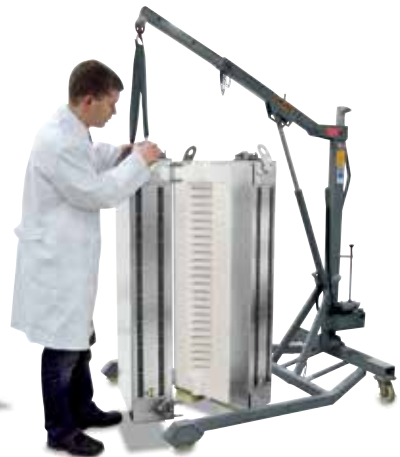
RS 120/1000/11S in divided version. Both half furnaces are manufactured identically and will be integrated in an existing gas-heating system with space-saving design