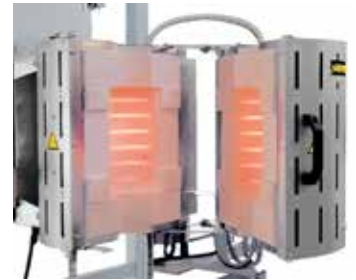
RS 100/250/11S in split-type design for integration into a test stand

Based on our standard models, we develop individual solutions also for integration in overriding process systems. The solutions shown on this page are just a few examples of what is feasible. From working under vacuum or protective gas via innovative control and automation technology for a wide selection of temperatures, sizes, lengths and other properties of tube furnace systems – we will find the appropriate solution for a suitable process optimization.