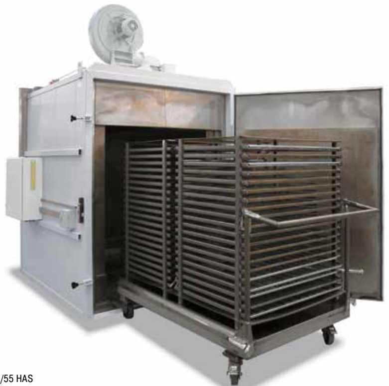
N 2380/55 HAS Forced convection furnace plant with charging cart for sheet metal tempering