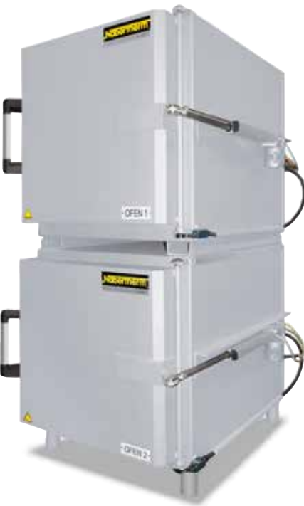
Chamber furnace system consisting of two forced convection furnaces N 60/65 HA with electric swing door opening for cooling and convenient furnace charging

By upgrading a furnace with useful accessories and devices for charging, you can considerably accelerate and simplify your heat processing which increases your productivity. The solutions shown on the following pages are only a part of our program, available in this product range. Ask us about accessories you may need. Our team of skilled engineers is prepared to develop a custom solution with you for any particular problem.