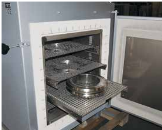
Forced convection furnace with charging grill shelves. The shelves can be moved individually on telescoping guides and can be taken out individually.